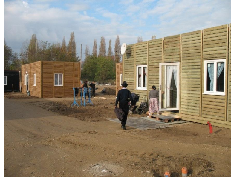
Project in Orly during the construction step