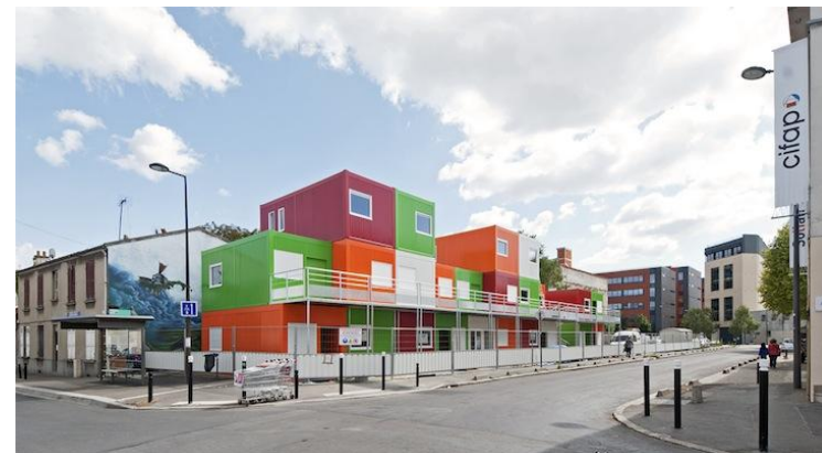
Project Montreuil Emile Zola street